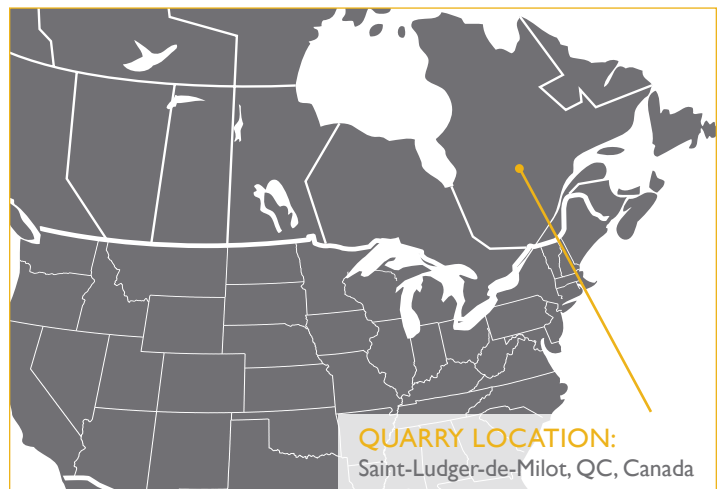
QUARRY LOCATION: Saint-Ludger-de-Milot, QC, Canada