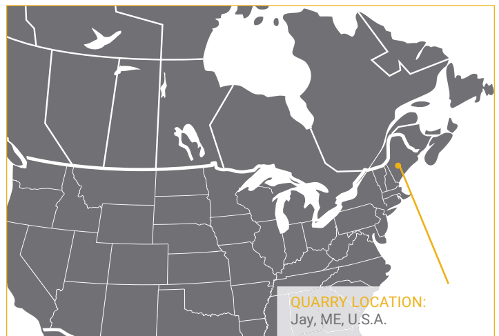
QUARRY LOCATION: Jay, ME, U.S.A.