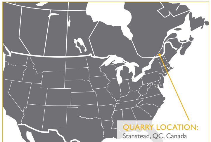
QUARRY LOCATION: Stanstead, QC, Canada