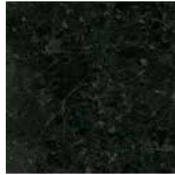
Saint Henry Black