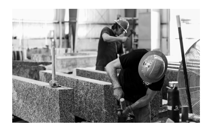
LOYAL AND DEDICATED TEAM

From the moment we cut the granite from our quarry our dedicated staff work tirelessly to provide a quality product to our valued customers, in a timely fashion.