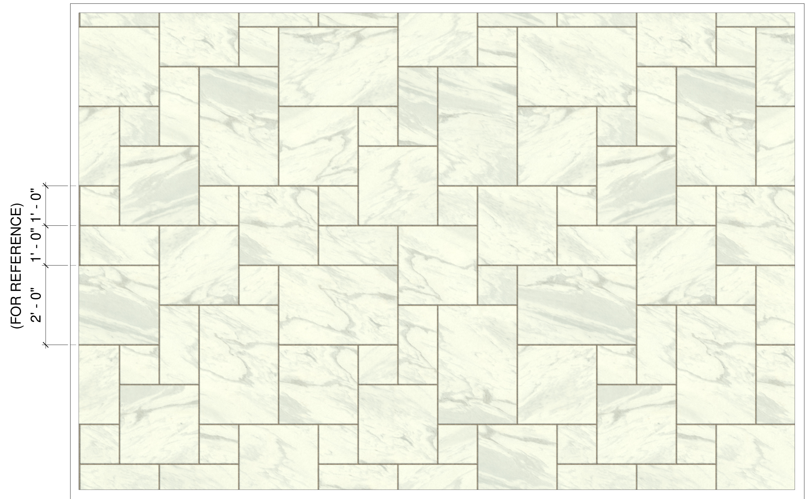
GEORGIA MARBLE™ - PEARL GREY - BILTMORE PATTERN